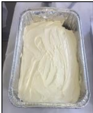
Table - Melody Mullins Cake - Billie Harris