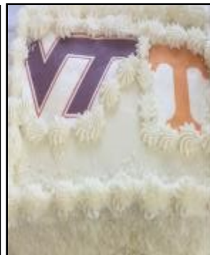
Table - Susie Clasby & Susie Powers Cakes - Linda Bailey Susie Clasby & Susie Powers